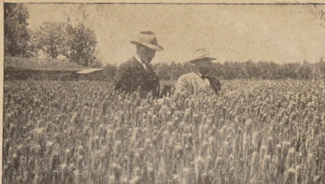
A fine crop of Certified Wong Barley. The new wonder Barley that is producing such tremendous yields.

Our own staff of experienced plant breeders, assisted by Experiment Station officials, constantly breed and improve our strains of small grains. The State Crop Improvement Association carefully inspects our breeding fields as well as the larger fields grown from this foundation or certified seed that produce the seed we offer you. These fields are carefully rogued before harvest to eliminate any mixture.